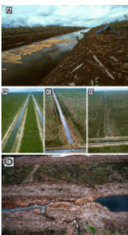
Figure 5. Aerial photos: A: Large peat layer of several metres is visible in the parent primary channel of the MRP area. Loggers use the channel for transporting timber. B: Parent primary channels (110km long). C: Secondary channel. D: Tertiary channel. E: Peat barrier, no sluices between one side of the PPC and the other (Fig. 4). Water flows out gradually. No sluices are available. Loggers transport the trunks.