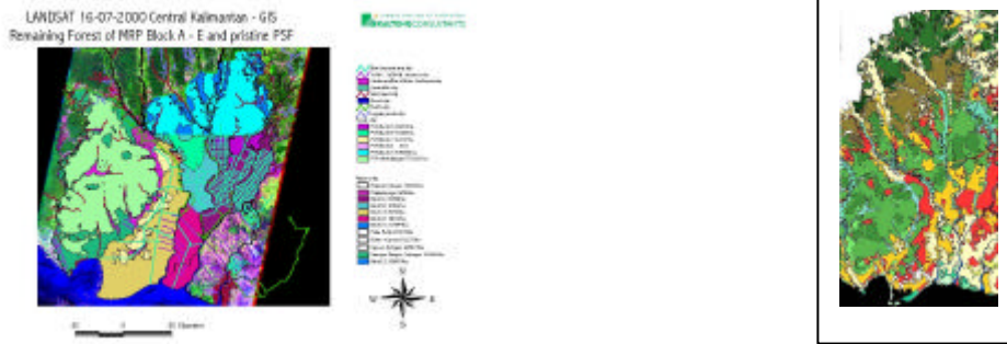
Figure 1a. Remaining Forest in 2000, comp. Table 2. Fig.1b Vegetation classification for two Landsat images 7/2000